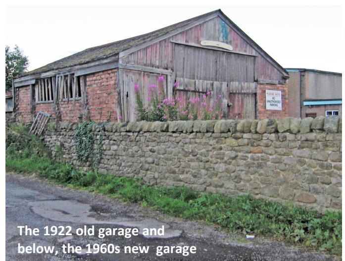
The 1922 old garage and below, the 1960s new garage