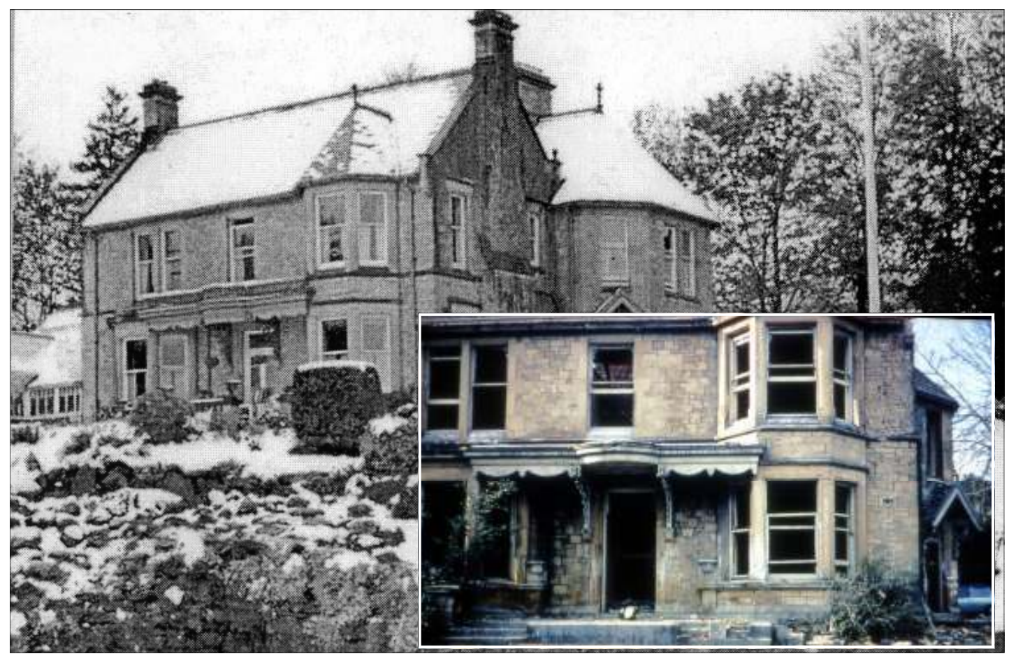
Linton House (1947) stood at the west end of Belmont Gardens where the Haydon Bridge High School Sports Hall is today. (See page 5) The beautiful property was allowed to go to wrack and ruin under the ownership of Northumberland County Council. (See insert) The ruin became an exciting, and at times scary, playground for local children in the 1960s.

THE NEXT ISSUE OF THE HAYDON NEWS WILL BE PUBLISHED IN APRIL 2013