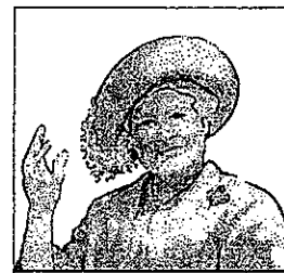
HER LATE MAJESTY QUEEN ELIZABETH THE QUEEN MOTHER

Mass on weekdays (except Mondays), at 10.00am, either at St John's or at Haltwhistle.